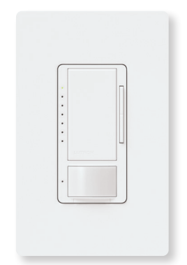
Maestro LED+ dimmer sensor