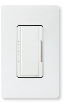
Maestro LED+ dimmer*