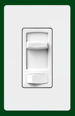
Skylark Contour LED+ dimmer