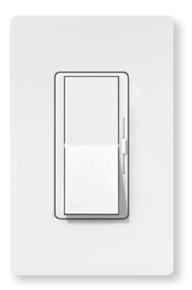
Diva LED+ dimmer