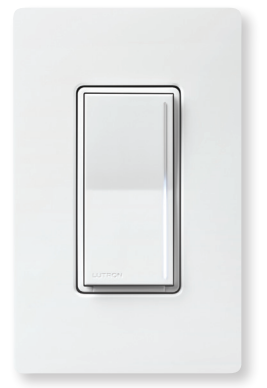
Sunnata LED+ dimmer*