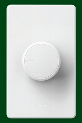
Dalia LED+ dimmer