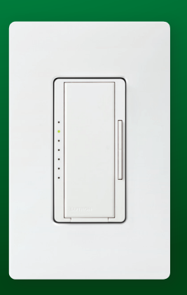
Maestro LED+ dimmer