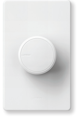
Dalia LED+ dimmer