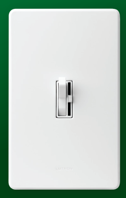
Ariadni LED+ dimmer