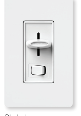
Skylark LED+ dimmer