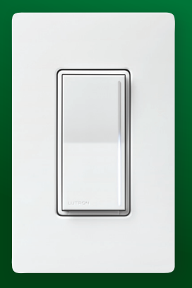
Sunnata LED+ dimmer