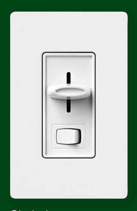
Skylark LED+ dimmer