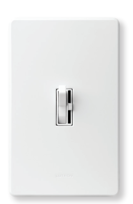
Ariadni LED+ dimmer