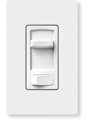
Skylark Contour LED+ dimmer