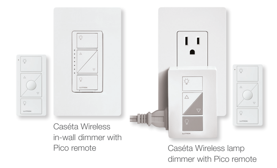
For more information visit lutron.com/casetawireless