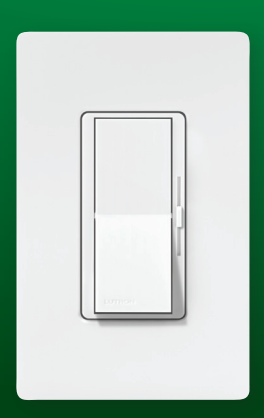
Diva LED+ dimmer