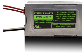
CASE STYLE: M